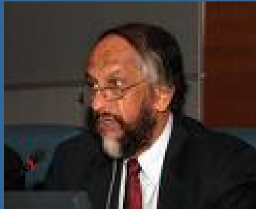
GRI conference 2008